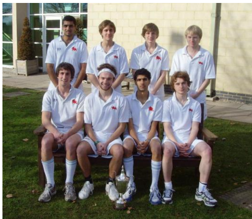
CURFC v. Oxford 2010